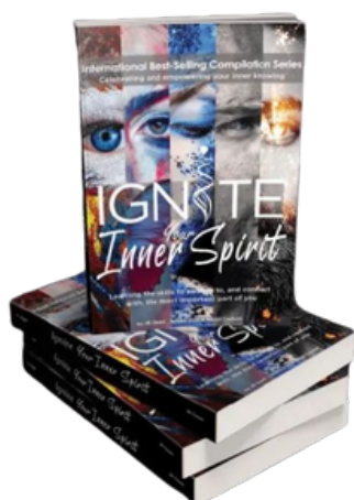
IGNITE YOUR INNER SPIRIT