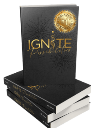
IGNITE POSSIBILITIES (1st Edition)