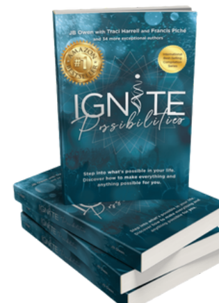
IGNITE POSSIBILITIES (2nd Edition)