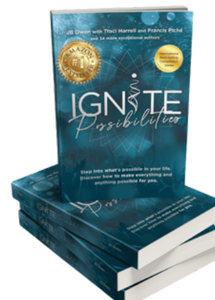
IGNITE POSSIBILITIES (2nd Edition)